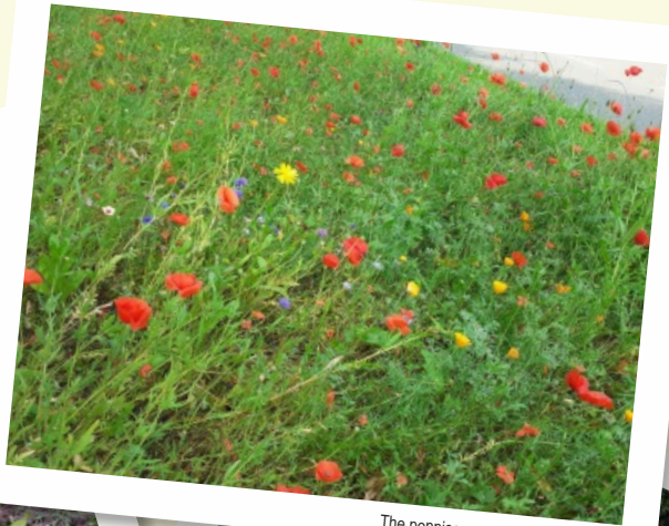
The poppies were at their best in July