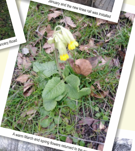
A warm March and spring flowers returned to the grass verges