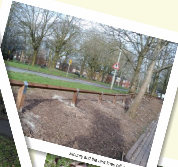
January and the new knee rail was installed