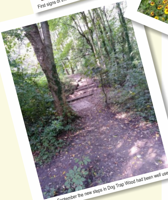
By September the new steps in Dog Trap Wood had been well used