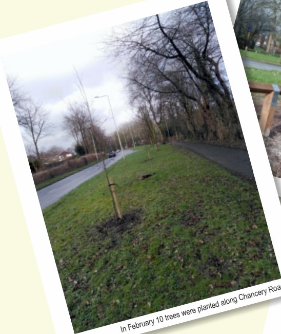
In February 10 trees were planted along Chancery Road