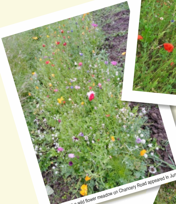
First signs of the wild flower meadow on Chancery Road appeared in June