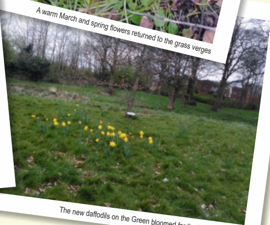
The new daffodils on the Green bloomed for the first time in April